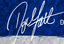
Dorian Yates 6x Mr. Olympia, President, DY

“ TEMPRO™ was developed by my scientific panel of PhDs, nutritionists and technical consultants. I supervised the entire process. The proteins in TEMPRO™ are processed under cold temperatures to preserve their natural state. We use a diversified blend of 7 different proteins to support even faster and longer-lasting increases in protein synthesis and produce shakes with superior taste and texture. TEMPRO™ is the most delicious and anabolically potent protein supplement you will ever try. I use it at least twice a day, as does every athlete I train.”