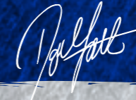
Dorian Yates 6x Mr. Olympia, President, DY

“ TEMPRO™ was developed by my scientific panel of PhDs, nutritionists and technical consultants. I supervised the entire process. The proteins in TEMPRO™ are processed under cold temperatures to preserve their natural state. We use a diversified blend of 7 different proteins to support even faster and longer-lasting increases in protein synthesis and produce shakes with superior taste and texture. TEMPRO™ is the most delicious and anabolically potent protein supplement you will ever try. I use it at least twice a day, as does every athlete I train.”