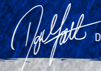
Dorian Yates 6x Mr. Olympia, President, DY

" TEMPRO™ was developed by my scientific panel of PhDs, nutritionists and technical consultants. I supervised the entire process. The proteins in TEMPRO™ are processed under cold temperatures to preserve their natural state. We use a diversified blend of 7 different proteins to support even faster and longer-lasting increases in protein synthesis and produce shakes with superior taste and texture. TEMPRO™ is the most delicious and anabolically potent protein supplement you will ever try. I use it at least twice a day, as does every athlete I train."